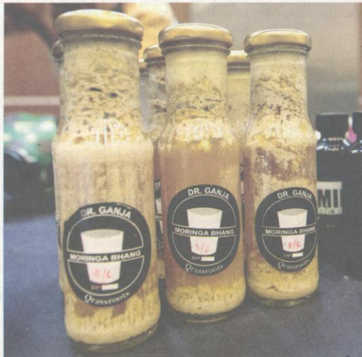
Cannabis-laced milk with the suspect’s label is sold for RM150 a bottle.

Kang said social media and instant messaging applications were used as his platform to promote his products, with customers having to travel to the suspect’s