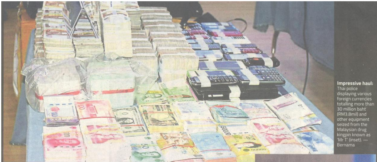
Impressive haul: Thai police displaying various foreign currencies totalling more than 30 million baht (RM3.8mil) and other equipment seized from the Malaysian drug kingpin known as 'Mr T' (inset).